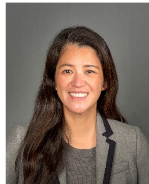
Honourable Malaya Marcelino Minister of Labour and Immigration

A handwritten signature in black ink, appearing to read "Malaya Marcelino".