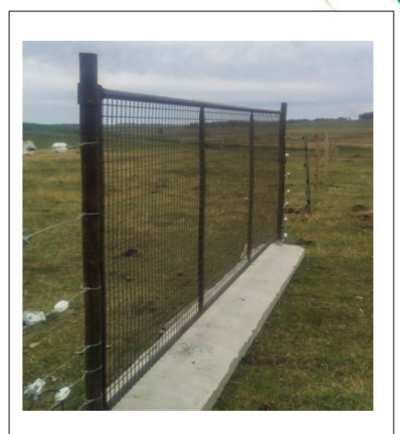
Gate with concrete threshold

Gates can be the weak point in a predator resistant fence. Gates should be the same height as the surrounding fence and provide a tight fit to the fence. An electric wire can be included on top, or the entire gate can be electrified. Burrowing under the gate should be deterred by installing a wire net apron underneath and extending out from it or another barrier such as concrete threshold.