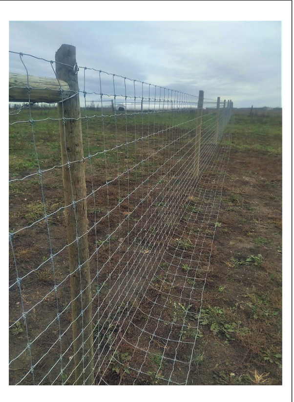
Fixed-knot fence with apron to deter burrowing

A wire-net apron (ground cover) with openings less than or equal to 15 cm (6") is also recommended to extend from underneath the fence, outwards to at least 40 cm (16"). This should be affixed to the fence and the ground to prevent predators from lifting it up and digging under. It is possible to purchase fixed-knot or other fencing with the apron already attached.